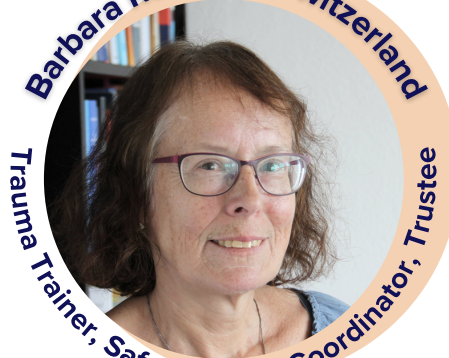
Trauma Trainer, Safeguarding Coordinator, Trustee